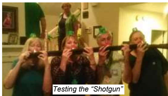
Testing the "Shotgun"