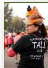
At Walk to Feed the Hungry 2014