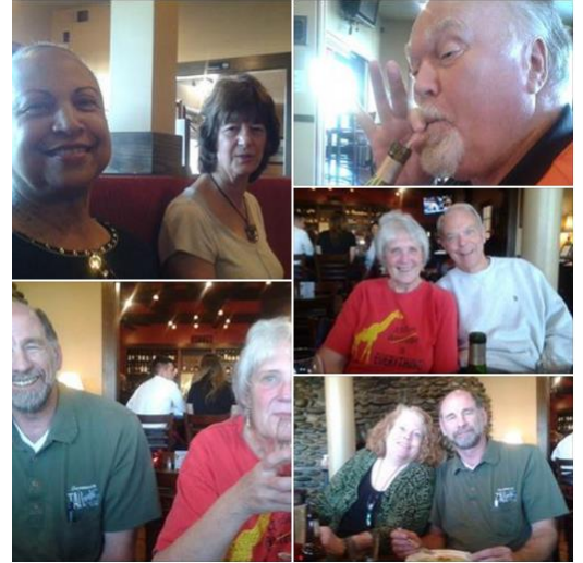
TGIF at 19 Handles