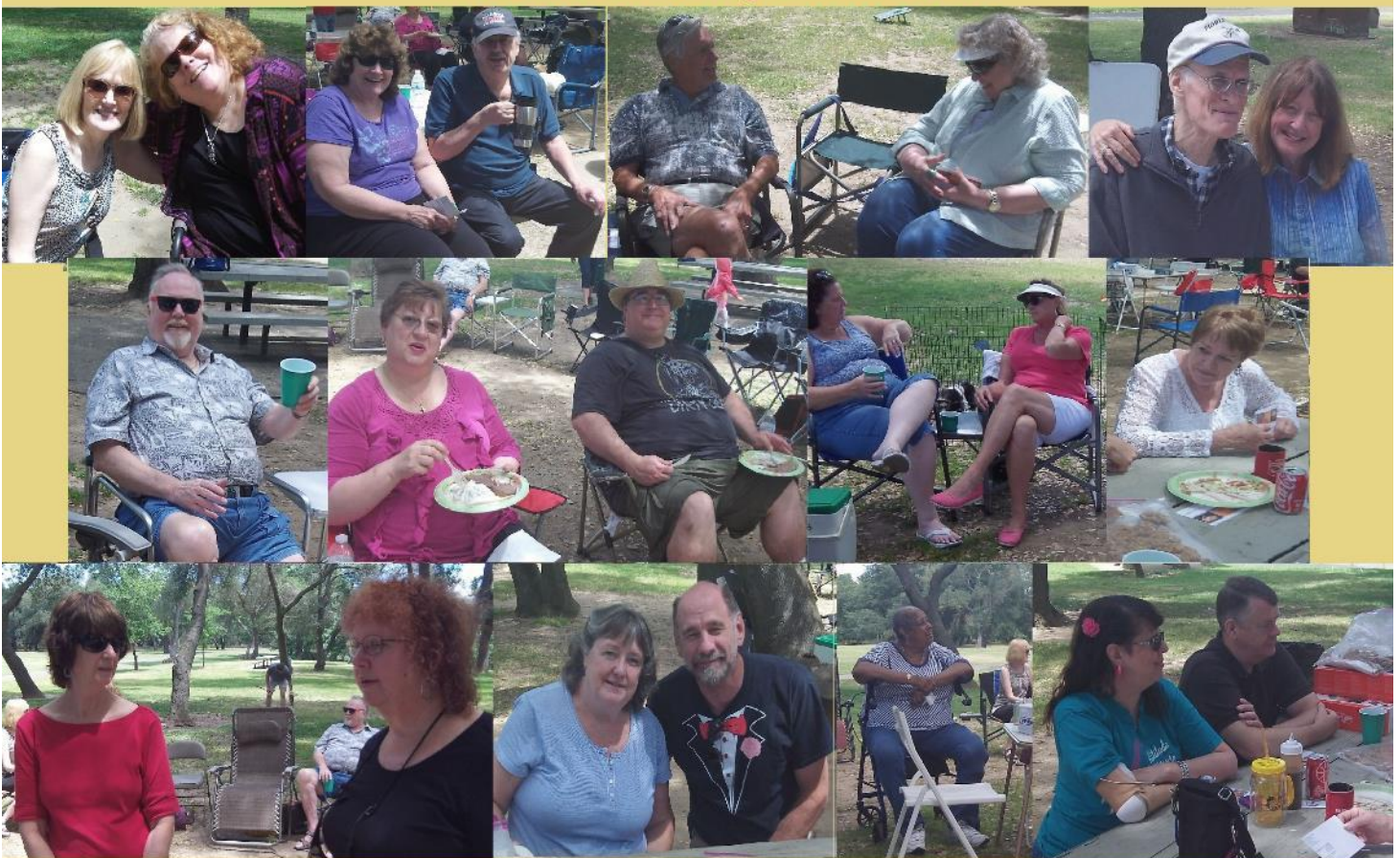
River Bend Park, Rancho Cordova