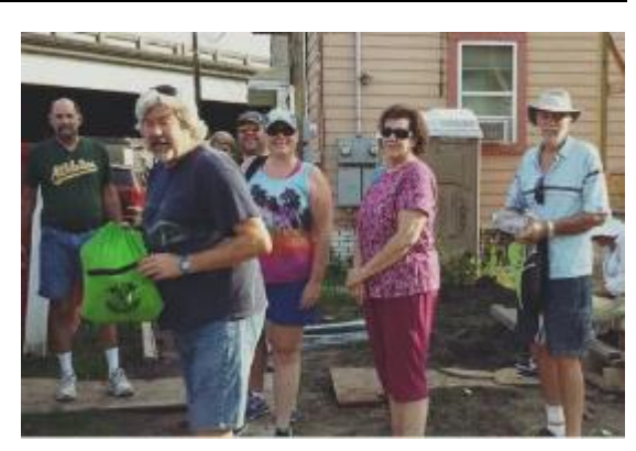
Pre-Con at a Habitat house

Pre-convention started out with a work day for "Habitat for Humanity". A group of us worked on a house doing siding, insulating and other miscellaneous projects.