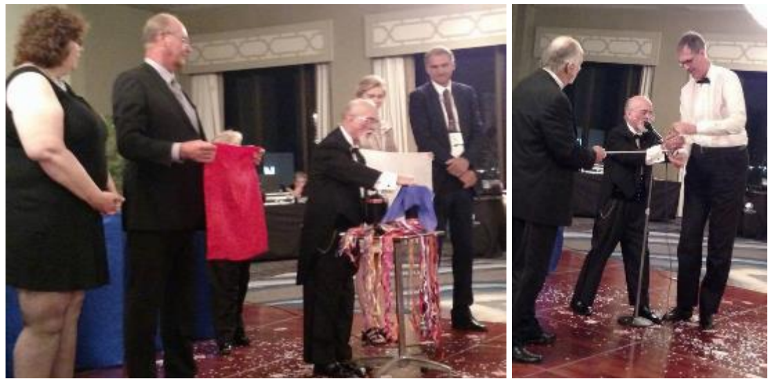
Magic Show.