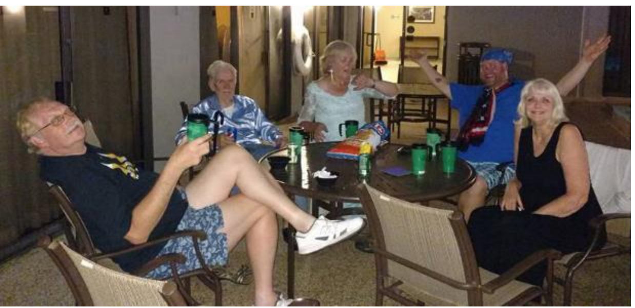
The Dawn Patrol, Sunday morning around 4:00 a.m.